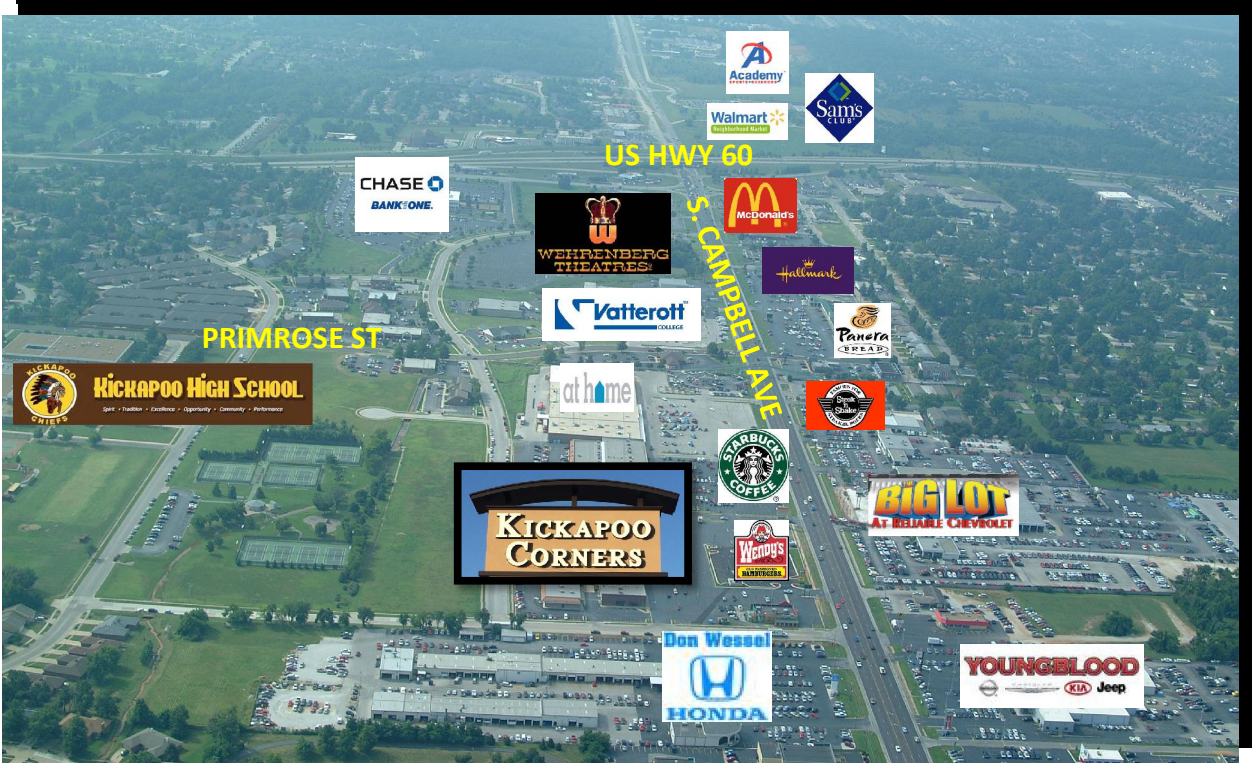
Kickapoo Corners View to the South